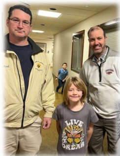
Cali B Good 3-4 Grade